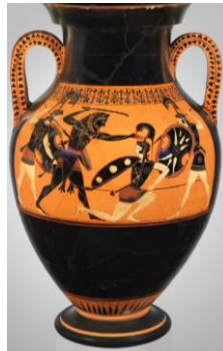
Figure 1. worldhistory.org (Hercules Battling Hippolyte)

confirmed through many paintings, poems, and other art works. The journey of defeating the queen of Amazon, Hippolyte, for example was epicly portrait on an ancient vas.