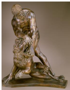
Figure 2. metmuseum.org (Hercules and the Nemean Lion)

The painting was trying to re-tell the tale of hercules in completing the task of seizing Hippolyte’s belt. However, the task went wrong when the Amazon Women thought that Hercules was going to kill their Queen. In fact, the queen was going to give her belt sincerely to Hercules. This misconsideration of her warrior forced Hercules to murder Hippolyte. This tale might be not as famous as Hercules’ first task, killing The Nemean Lion.