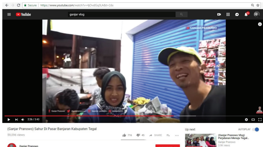
Figure 3. Vlog “(Ganjar Pranowo Vlog) Sahur di Pasar Banjaran Kabupaten Tegal” ( https://www.youtube.com/watch?v=4jOvsIGq3LA&t=147s )